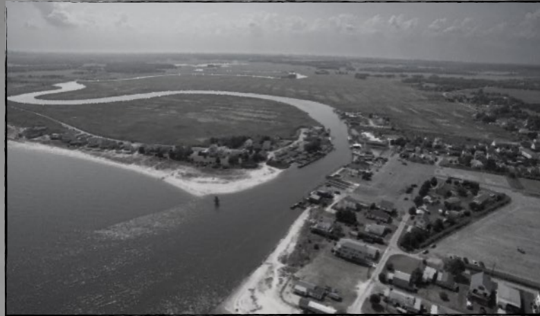
Birds Eye View of the town of Bowers. The Murderkill River runs between Bowers and South Bowers, Delaware.

The town rests against the Delaware Bay that leads to the North Atlantic Ocean. The prime location of Bowers with a very small population lends itself greatly to be overtaken by an extremely unique race of Aliens. With only a few Officers on the Police force, one Judge, an insignificant Mayor, and few major businesses it's almost too perfect.