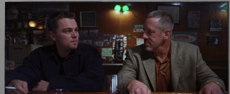
'The Departed' (2006) Directed by Martin Scorsese