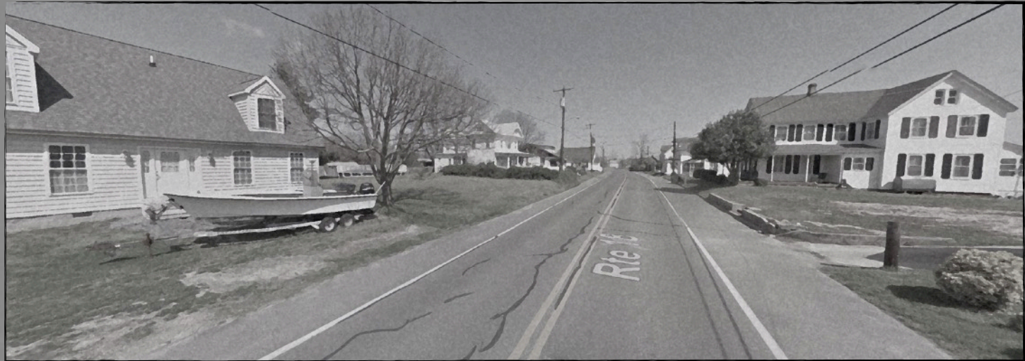
(above) Main Street, Bowers, DE.