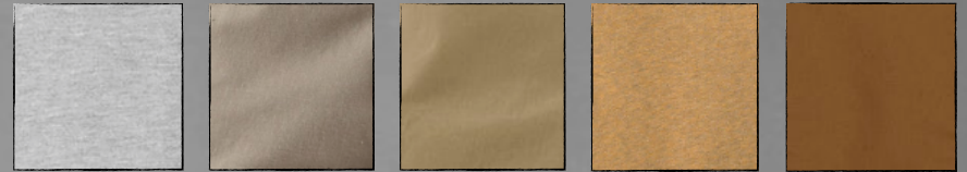
Jack's color palette - first act

Early onscreen Jack will dress in muted browns, tans, and grey colors to show the unclear direction of his mind.