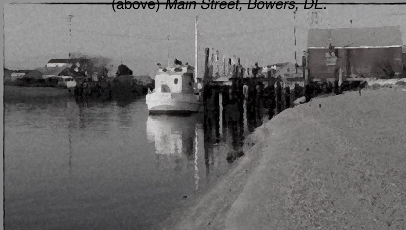
A docking area for boats on the Delaware Bay of Bowers, Delaware.