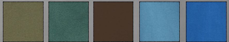
Jack's color palette - second act

Entering into the second act Jack's attire shifts slowly into greens, deeper browns, and bluish greys. This signifies his transition to blend with nature by displaying earth tones. He is getting out of his mind while realizing there are odd changes happening in his natural environment.