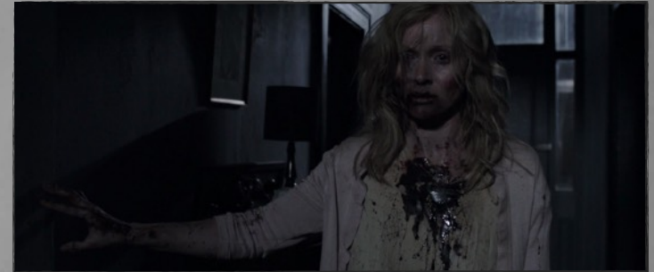
'The Babadook' (2014) Directed by Jennifer Kent