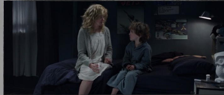
'The Babadook' (2014) Directed by Jennifer Kent

Production will use an Arri Alexa Mini to capture the Alien film. The aspect ratio will be either 2.35:1 or 2.39:1 depending on camera tests to create our desired look.