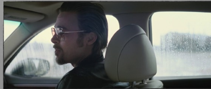
'Killing Them Softly' (2012) Directed by Andrew Dominik